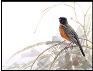
Spring Robin by Julie Zickafoose.

Because of problems with a leaking roof, and the need for an upgrade in our heating and cooling systems, the library is preparing for a rather large renovation project! This spring, we will be getting a new, pitched roof along with new furnaces and a cooling unit. This will reduce operating costs (think green!) as well as protect our books and computers from the threat of water damage. This is the good news! The bad news is that the main portion of the library will need to be closed for approximately 3 months, probably April through June. But don't worry! We plan on continuing to offer most library services during that time by operating out of the Children's room and the Dorothy Lee room.