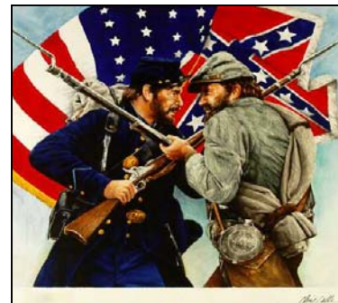
The Eleventh Michigan Infantry was recruited at White Pigeon; the organization was completed Sept. 24, 1861, with an enrollment of 1000 officers and men.

*View the uniforms of local veterans that will be on display all week long.